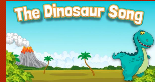
The Dinosaur Song