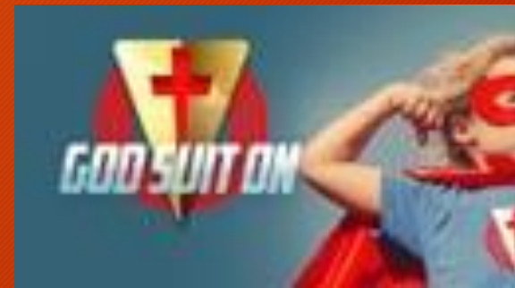
God Suit On